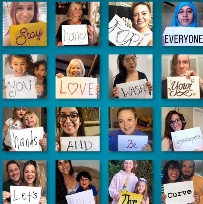
COLLAGE FROM WHIRLWIND MISSIONS, INC.

IN THEIR OWN WORDS Missionary Stories from the Field ..... PG. 2-4